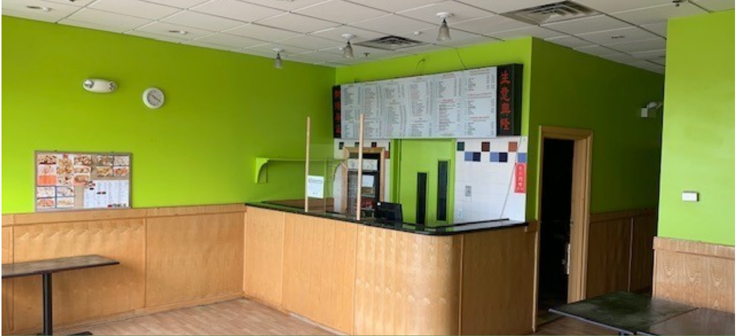
Unit 143 - 2nd Generation Restaurant