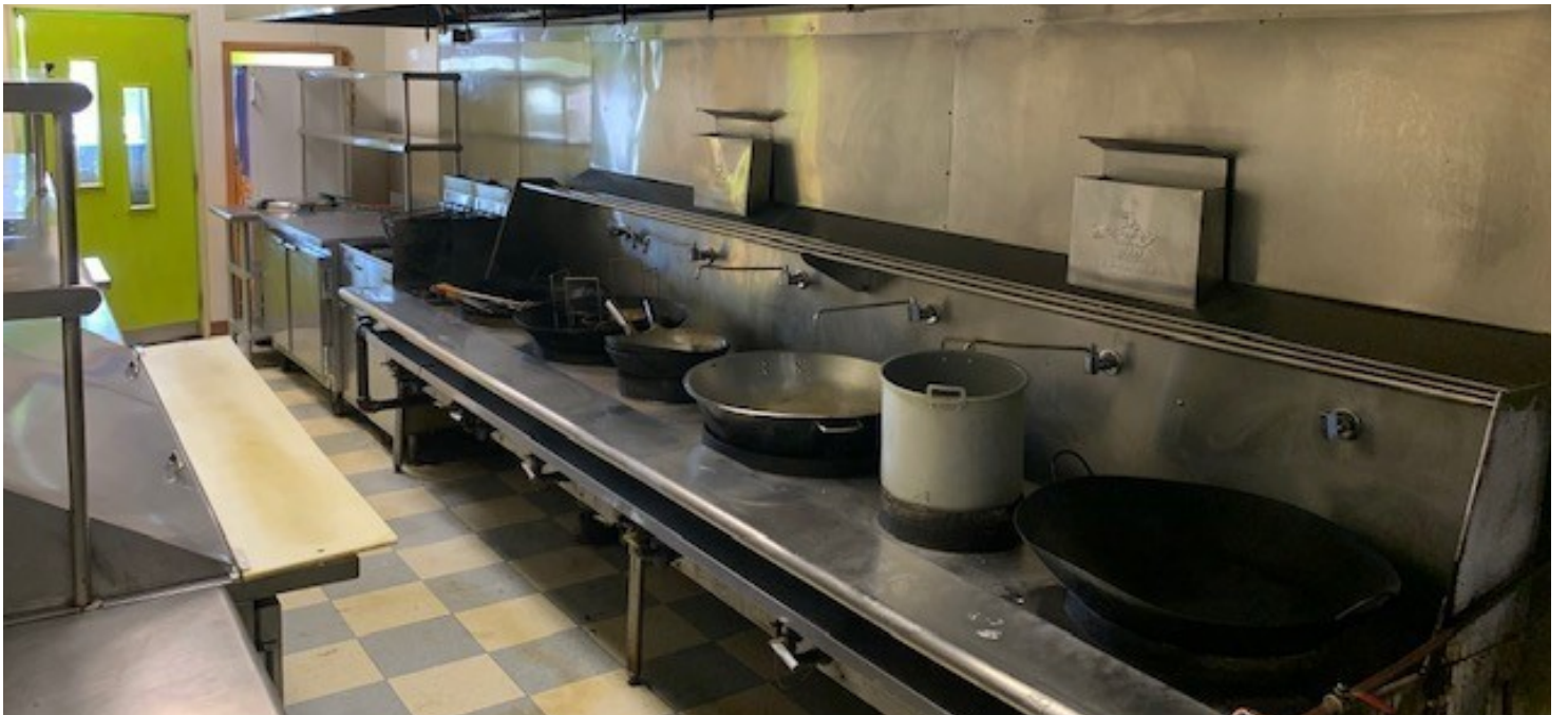
Unit 143 - 2nd Generation Restaurant